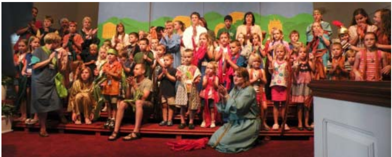
2009 VBS at Westkirk Watch for more photographs next month