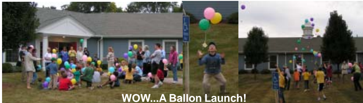
WOW...A Balloon Launch!